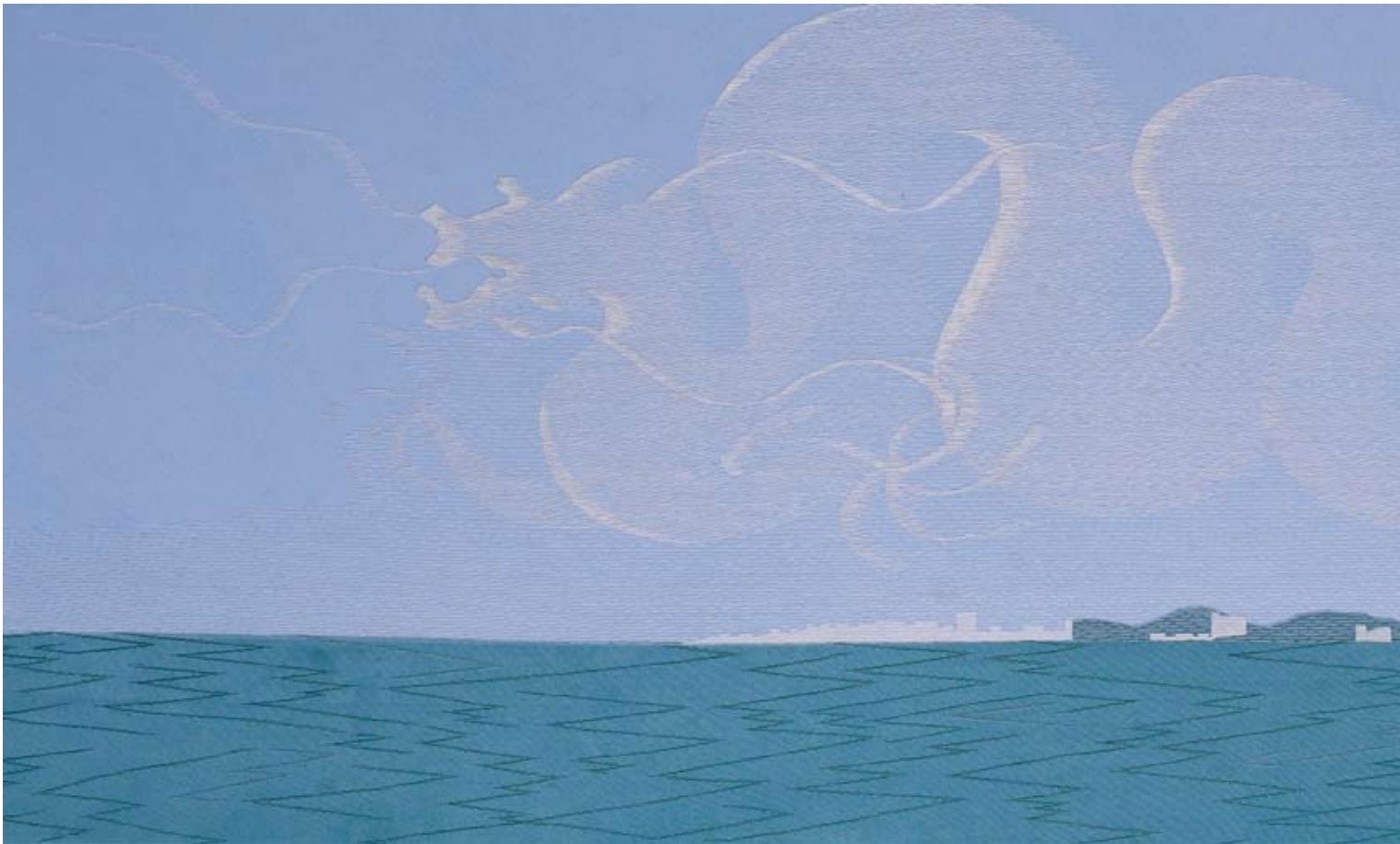
Textile Art with glowing colours, growing in Jessica B Watson's concepts